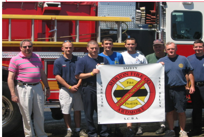
Firefighters from the Merion Fire Company in Ardmore, Pennsylvania, with their customized Everyone Goes Home banner show that they're on the forefront of the national firefighter safety commitment.

Are you advancing the Life Safety Initiatives in your department? Please tell us how, so we can share your successes with your brothers and sisters across the country. And don't forget: We're accepting nominations for the Seal of Excellence recognition program. Just send us a maximum two-page description of the Initiative(s) you're implementing, why you're implementing it, and how you're implementing it, as well as the individuals (or department) involved. Be sure to include all your contact information. Send your nomination to everyonegoeshome@firehero.org .